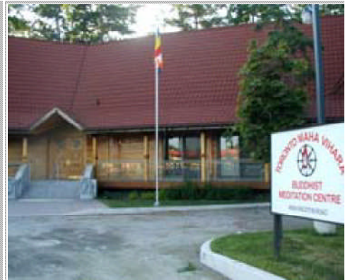
Above: entrance to the meditation centre.

Across the street, on Kingston Avenue, the cars are whizzing by. They are driving so fast, without any signs of slowing down, that I wonder if they have all read the sign in the middle of the nearby car-dealership parking lot that reads "Dodge." Dodge: "to avoid, by movina suddenlv." But what are they all